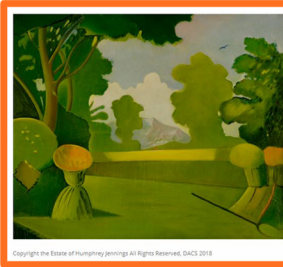
Untitled by Humphrey Jennings