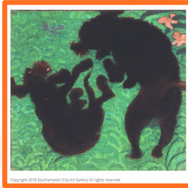
Deux Chiens by Pierre Bonnard