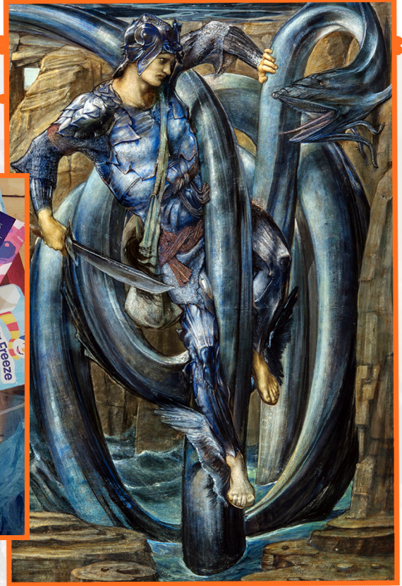
Edward Burne Jones - Doom Fulfilled Image (detail)